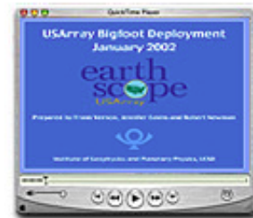
View a QuickTime presentation on the USArray.