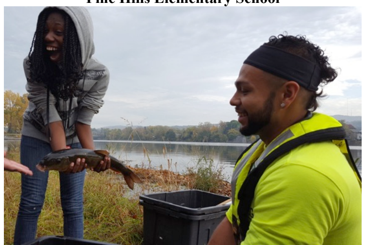
59 students – 9<sup>th</sup> & 10th grade, 5 adults total 42°47.051'N and 73°40.706 W

Peebles Island State Park, Waterford, NY Laura Murawski, Cohoes High School Pine Hills Elementary School