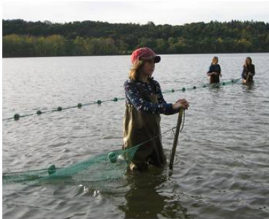
Above: Seining at Stuyvesant Landing. Right: Mud crab at Swindler Cove on the Harlem River.

Students with seine nets, as well as catch-and-release traps, caught hundreds of fish and dozens of species on A Day in the Life of the Hudson River Estuary. There were some exciting finds, including lots of young blue crabs the size of a quarter, a juvenile crevalle jack usually found in warmer waters, slippery eels, and bizarre little stickleback fish at several sites. The table below displays catches from just a handful of sites.