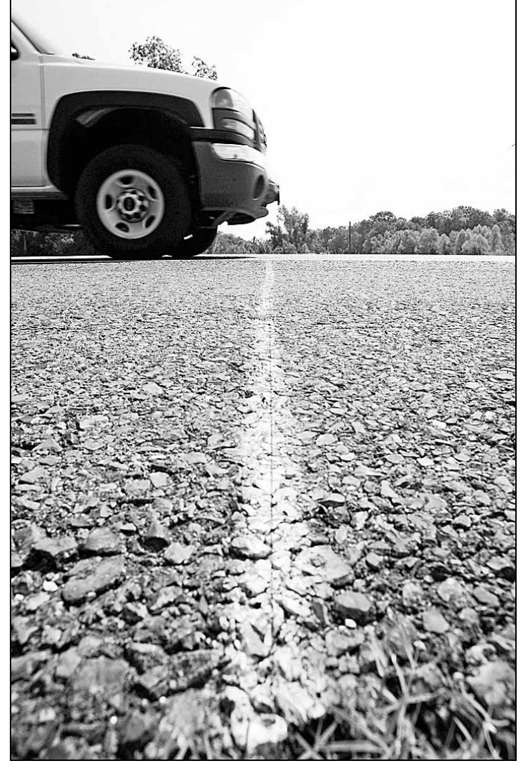
DESIGNATOR: A painted line shows where a petroleum pipeline crosses through East Baton Rouge Parish in Louisiana.

Where orange and yellow lilies once grew, all that's left is a grass-covered hump. Beneath it, a ridge of cement covers the