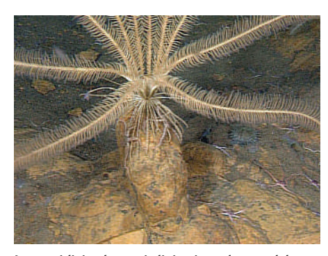
Iron-oxidizing bacteria living in and around deepsea vents make conditions perfect for sea lilies.

ridge north of the islands, where the hot magma lies close to the sea floor, would yield the focused flow of high-temperature fluid needed to form black-smoker chimneys. And nobody had yet explored this area for vents.