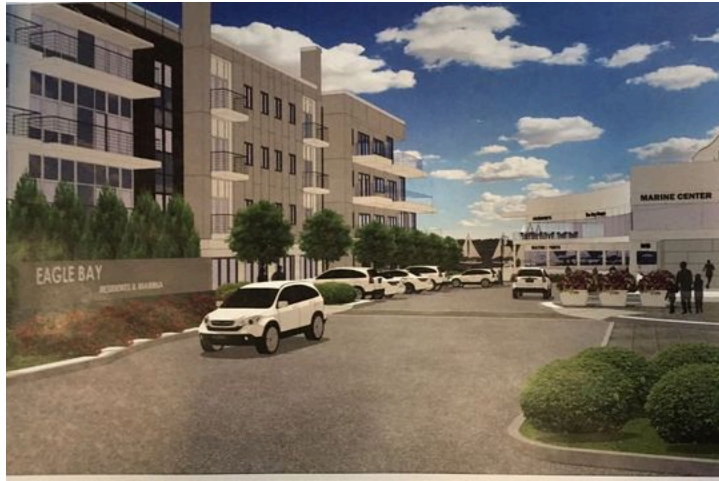
Architectural rendering, 2018. Stony Point, NY 10980 315.464.2272 315.464.2273 EAGLE BAY Stony Point, NY THE BREAKERS STONY POINT, LP. VIEW 6