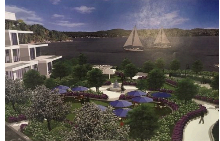
Architectural rendering, 2018. Stony Point, NY 10980 315.464.2272 315.464.2273 EAGLE BAY Stony Point, NY THE BREAKERS STONY POINT, LP. VIEW 8