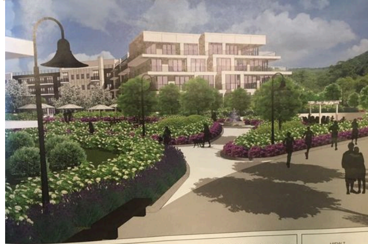
Architectural rendering, 2018. © 2018 The Breakers, LLC. All rights reserved. Stony Point, NY 10980 315.464.2272 315.464.2273 EAGLE BAY Stony Point, NY THE BREAKERS STONY POINT, LP. VIEW 7