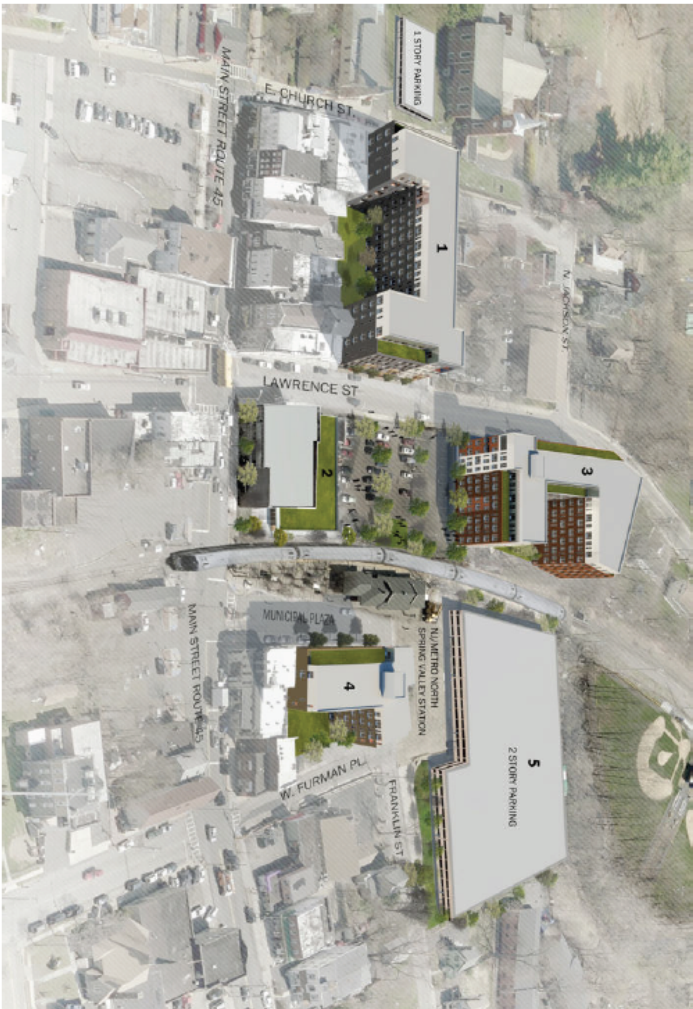
An aerial photo of Concord Capital New York's proposed transit-oriented development in Downtown Spring Valley.