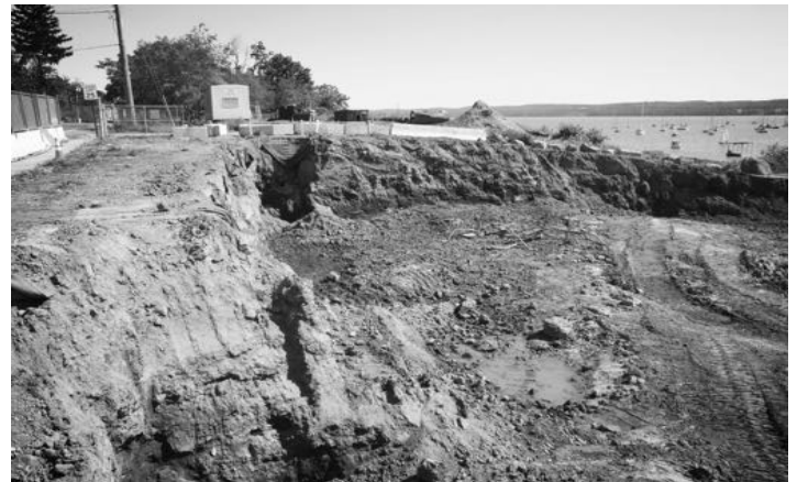
Site clean up included bulldozing, dredging and capping.

The site was home to Nyack Gaslight & Fuel and then Con Edison from 1859-1965 where oil and coal was treated & shipped from the waterfront. During this time, carcinogenic coal tar, a hazardous by-product of the operation, seeped into the soil and water. Declared a Superfund site, quotes of $12 to $23.7 million was spent to clean the fenced area by Orange & Rockland between 2005 and 2015. Helmer Construction has owned part of the area for about 20 years hoping to develop on the waterfront.