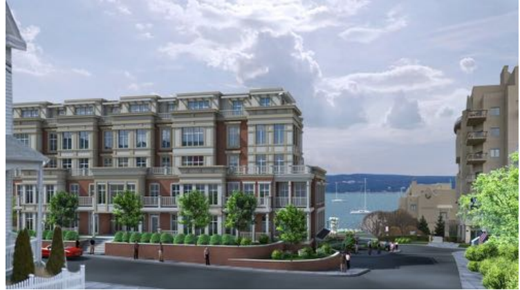
Current image from project website. View from Gedney. For more: https://www.gedneystreetproject.com