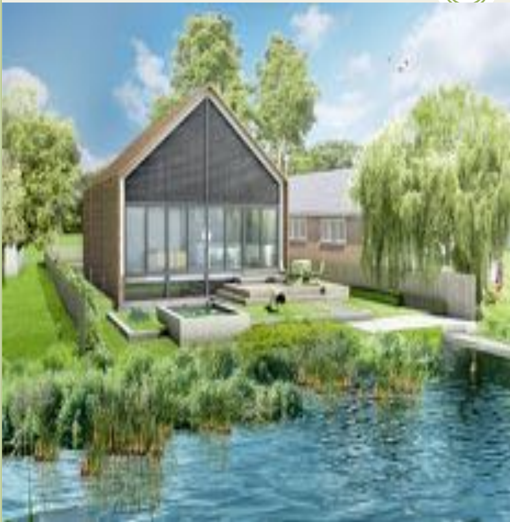
Amphibious House near Marlow, River Thames, U.K.