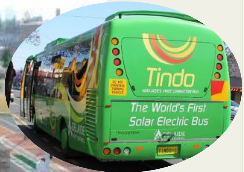
Bus from Adelaide, Australia

(L) Bus Rapid Transit Design (R) 1 st Solar Electric Bus