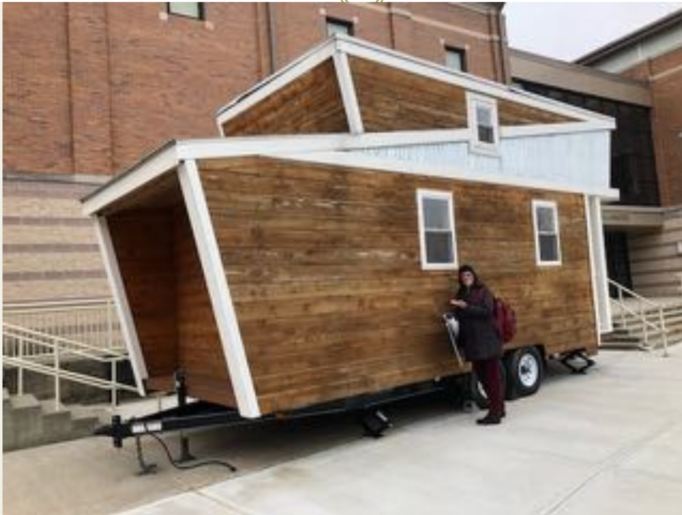
Student Built Tiny Construction at Irvington H.S.