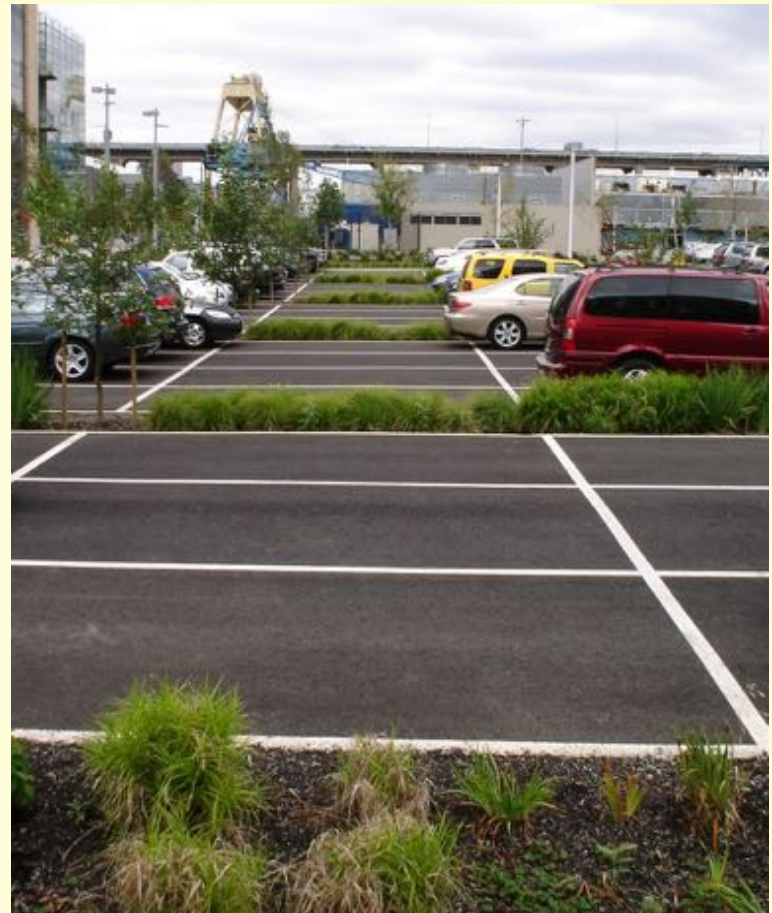
Vegetated Islands for 'run on'