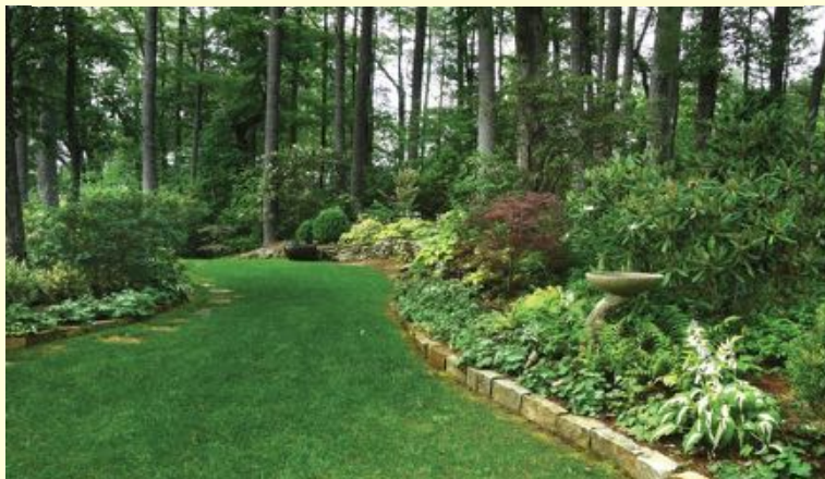
Maintaining Original Trees & Shrubs