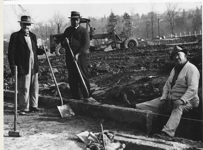
Photo of workers on the construction of the Tappan Zee bridge from Westchester archives.