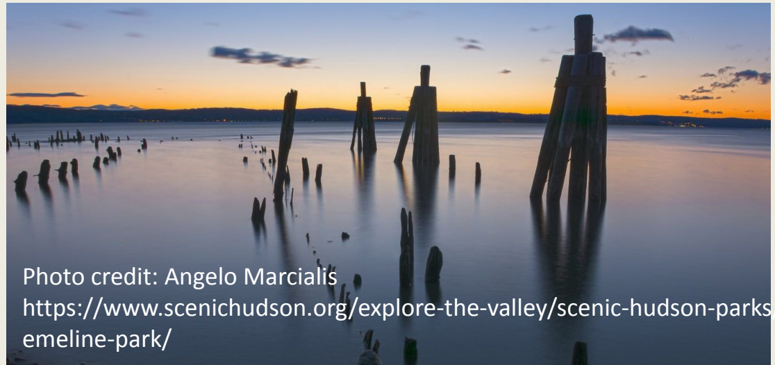
Photo credit: Angelo Marcialis https://www.scenichudson.org/explore-the-valley/scenic-hudson-parks/emeline-park/