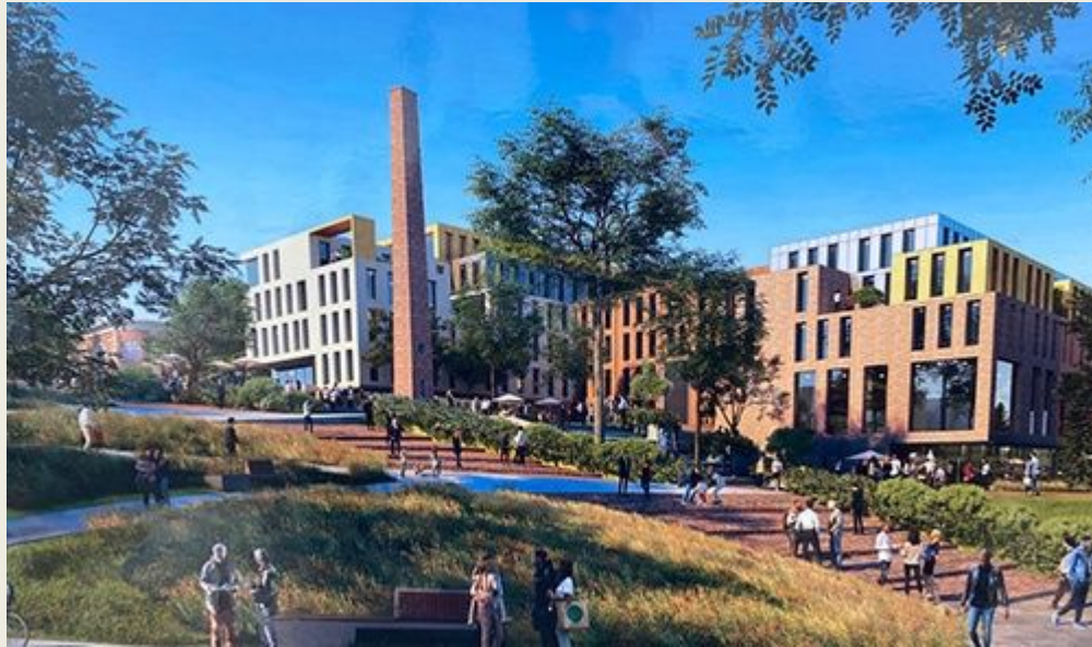
Chair Factory site rendering

The vision centers on a pedestrian focused center of activity with a “ Work-Live-Play Vibe ” including: