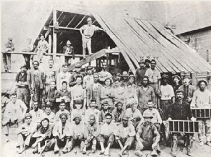
Early brick workers from Haverstraw. The job brought ethnic diversity.