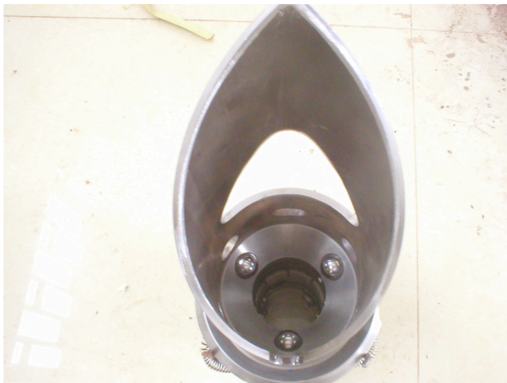
Figure 4. Hole lock.