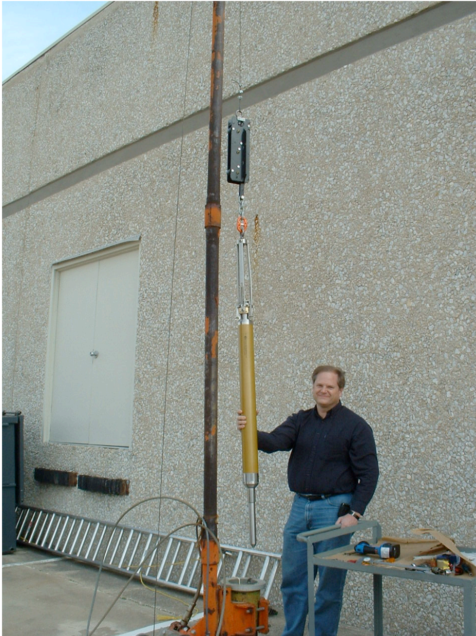
Figure 1. Prototype seismometer and accessories.

Figure 1 shows the seismometer and accessories ready for lowering into a borehole.