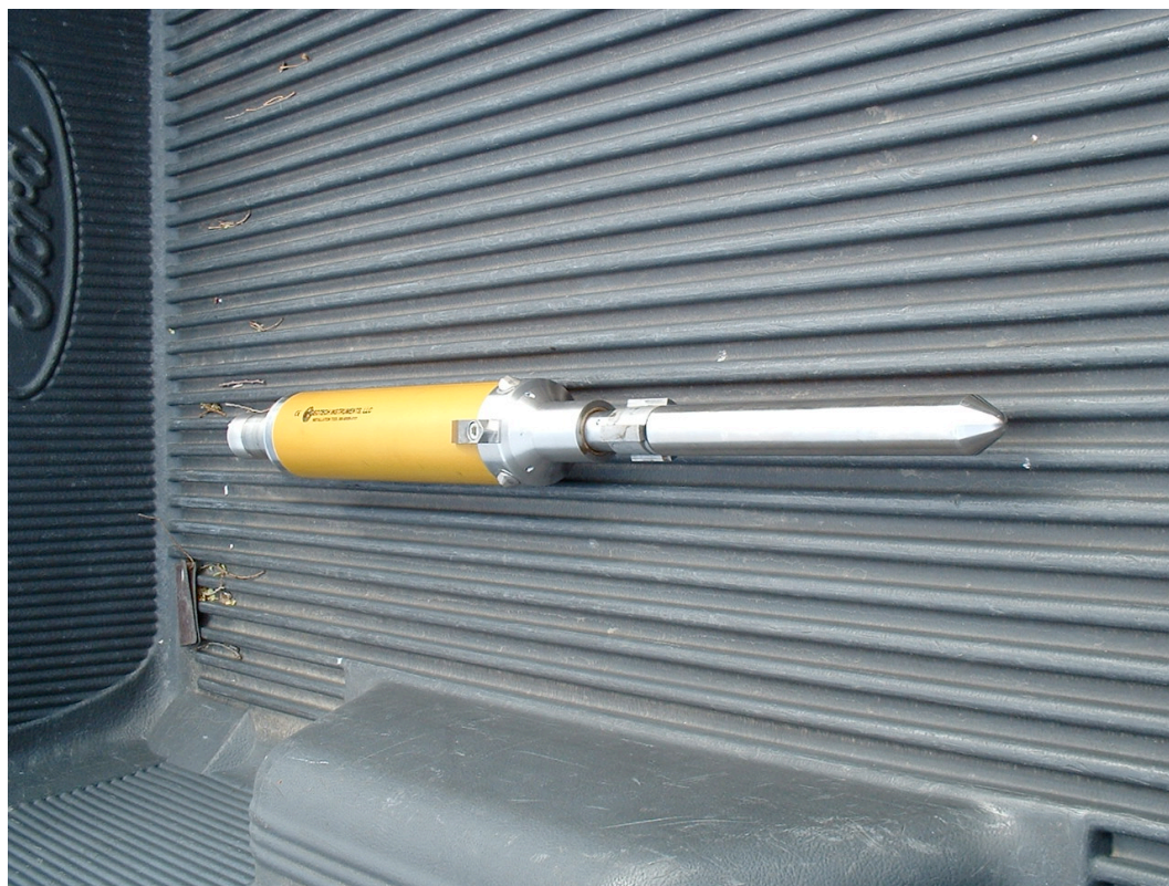
Figure 3. Hole lock installation tool.