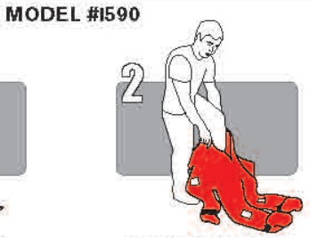
PULL ON AS YOU WOULD A PAIR OF COVERALLS