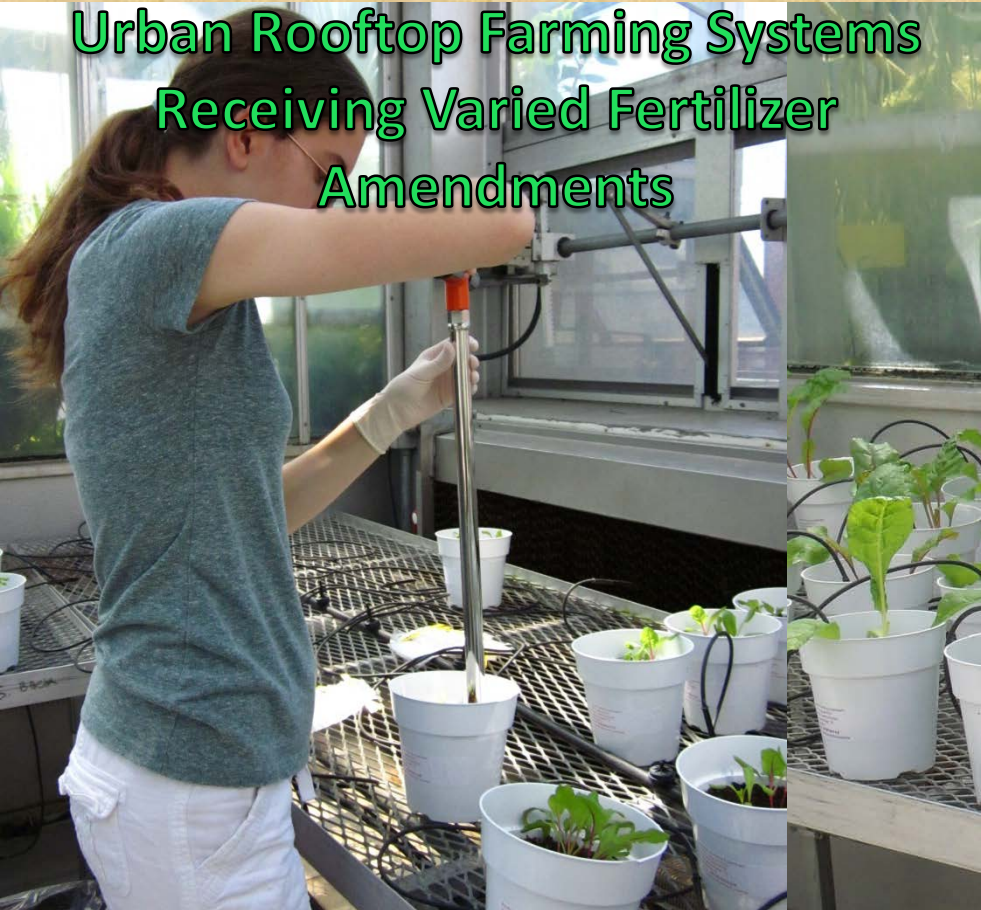
Average Concentration of DNA Extracted From Soil Collected 6/19-7/17

Assessing Bacterial Abundance in Urban Rooftop Farming Systems Receiving Varied Fertilizer Amendments