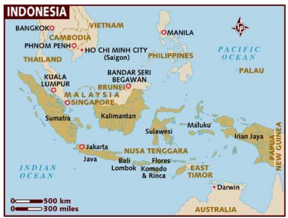
Map Indonesia which includes location of Java

'Mt Merapi is on Java, the most highly populated islands of Indonesia.'