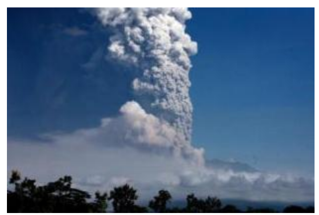
Mt. Merapi eruption

According to <u>TIME</u>, 'just after midnight Friday morning', Mt. Merapi, located in central Java, erupted 'sending heat clouds and ashes more then 4 miles (6.5 km) into the air', with '49 people killed in the blast'. The eruption, 'the most violent since 1872' when an eruption killed 1400 people. The total death toll since Mt. Merapi 'roared back to life' on Oct. 25, 'more than 90 people'. According to <u>CNN</u>, 'more than 80,000 people have had to flee the latest eruptions'. According to the latest report from the <u>Jakarta Globe</u>, the death toll stands at '122' with the city of Yogyakarta and its 400,000 residents on the 'highest alert'.