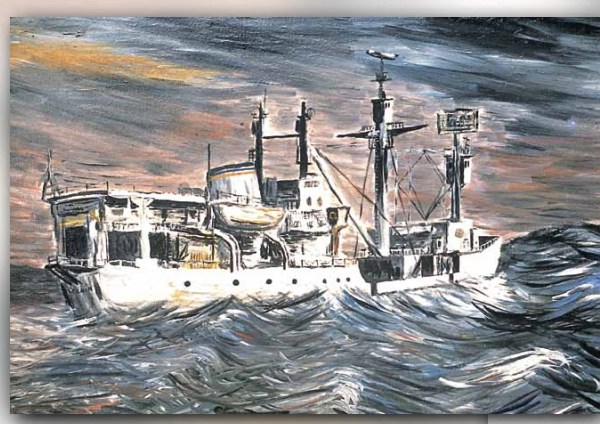
Figure 1. Two views of the Eltanin though photography (December 1971) and in oils, both by the author.