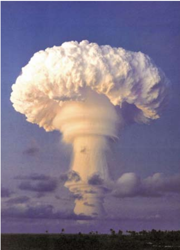
210 KT ATMOSPHERIC NUCLEAR TEST EXPLOSION 'TRUCKEE' CONDUCTED BY THE UNITED STATES ON 9 JUNE 1962 AT 15:37 GMT, 10 MILES SOUTH OF CHRISTMAS ISLAND, A NON SELF-GOVERNING TERRITORY OF AUSTRALIA.

phenomenon, and it was important to learn that their implosive nature could be reliably determined from seismic recordings.