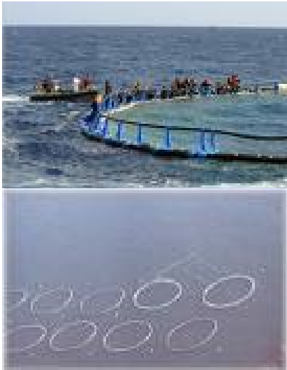
Figure 1: Website photos representing large, open ocean mariculture structures which could conceivably be modified into experimental maricorrals.

whether the curtain walls would necessarily have to be made of an impermeable material (i.e. a “shower curtain”) or whether an open net of some calculated mesh size could serve to provide a balance between resisting deformation from shear versus slowing advection of the perturbed water by breaking up the energy length scale. The depth of the curtain wall theoretically should be equal to or below the depth of the mixed layer where the perturbation was achieved and at or just beyond the thermocline.