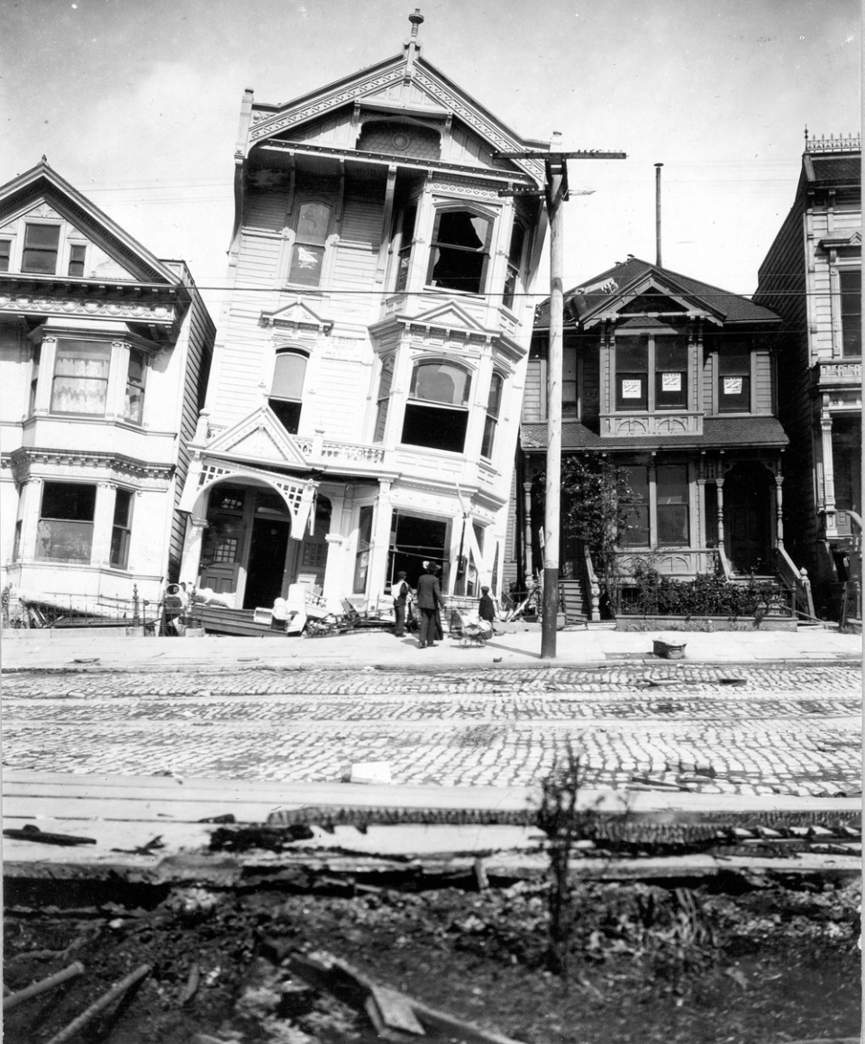
Photograph of building damage from 1906 San Francisco, CA earthquake by G.K. Gilbert. Courtesy of the U.S.G.S. Photographic Library ( libraryphoto.cr.usgs.gov/ ).