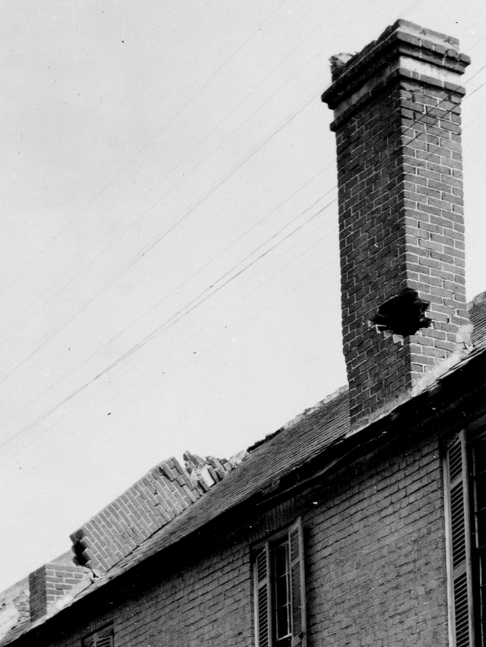
Photograph of chimney damage from 1886 Charleston, SC earthquake by J.K. Hillers. Courtesy of the U.S.G.S. Photographic Library ( libraryphoto.cr.usgs.gov/ ).