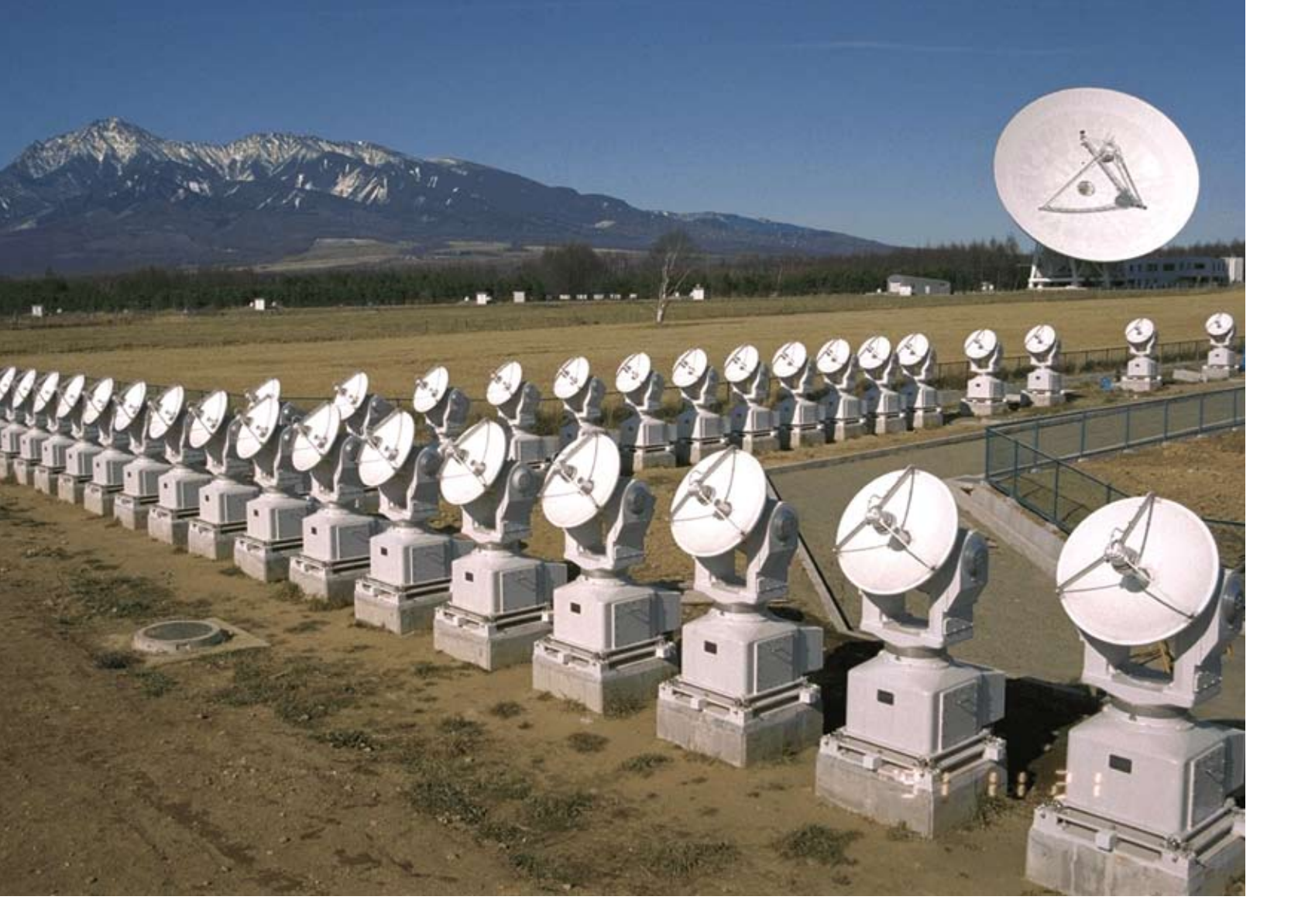
Figure 3. The Nobeyama Radioheliograph Array

fitted with a hydrogen-alpha filter, used to observe solar flares; a 30-centimeter heliostat for observing sunspot evolution; and a solar radio spectrograph that observes through a frequency range of 18 to 1800 MHz every 3 seconds to monitor solar radio bursts. Though optical instruments were established at CSO in 1976, the observatory was already the home of a thriving solar radio astronomy research program dating from just after World War II.