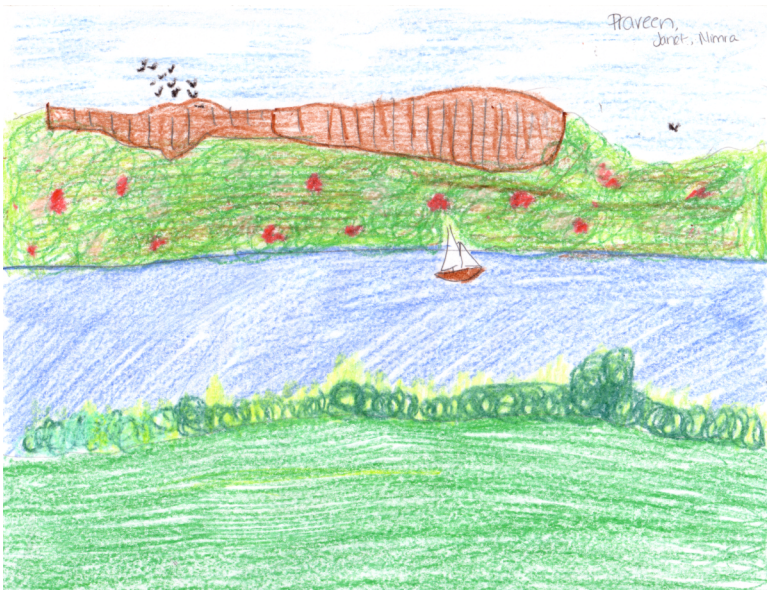
Location: Habirshaw County Park, Seining beach, Beczak Center, Yonkers in Westchester County