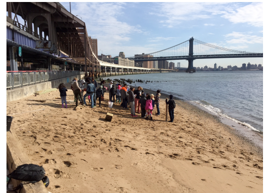
<sup>th</sup>, 5<sup>th</sup> & 8th graders, 27 students, 6 adults