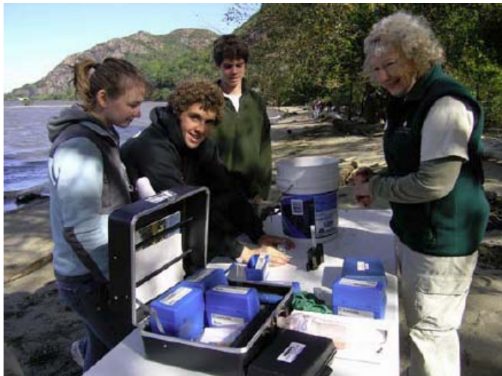
Students from Haldane High School and educators from the Hudson Highlands Land Trust studied the river at Little Stony Point, located between Garrison and Beacon.

The fact that student data is so much lower than what was recorded at the USGS sonde could be the result of inputs of fresh water from Indian Brook via Constitution Marsh, or the less sensitive equipment used in the student data collection.