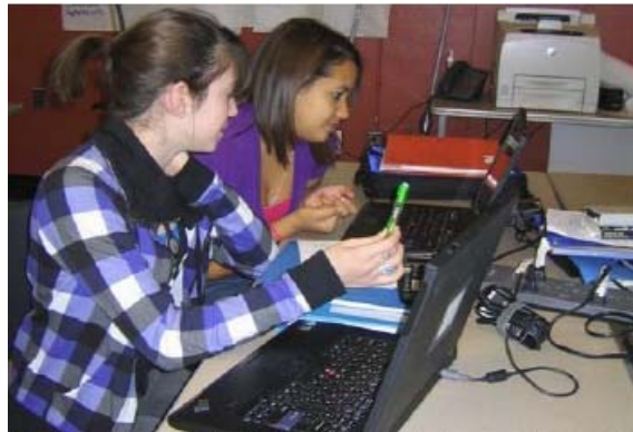
Students from Tech Valley High School use HRECOS data to examine how dissolved oxygen concentrations were changing during their sampling period.

Students from Tech Valley High School examined HRECOS data from Schodack Island to see how dissolved oxygen concentrations were changing at the time they collected their sample in Rensselaer. In the continuous data set, they observed rising dissolved oxygen concentrations throughout the morning and afternoon and declining concentrations at night probably due to the influence of photosynthesis and respiration (for a more detailed description of this type of phenomenon, see the HRECOS Story Plant Breath in the Hudson River available at www.hrecos.org ).