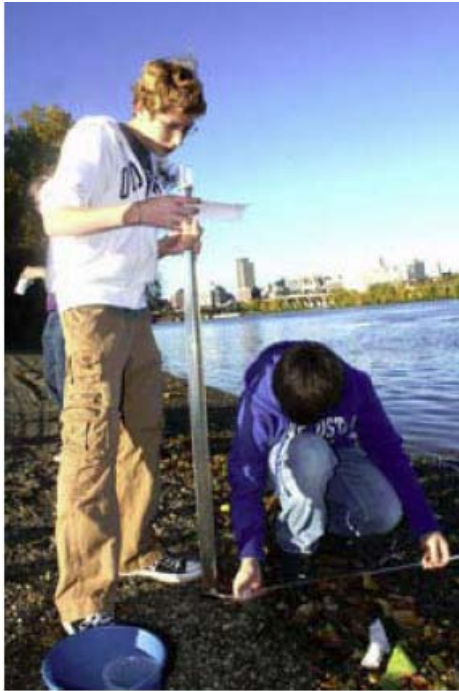
Students from Tech Valley High School measured turbidity at the Rensselaer boat landing as part of "A Day in the Life of the Hudson River."

On October 8, 2009, over three thousand students stepped out of their classrooms and into the Hudson River Estuary. Students stood on boat ramps and docks from Troy to New York City, collecting water quality data. They wrote descriptions of their sites, collected mud, water and invertebrate samples, seined for fish, and examined water chemistry parameters. The purpose was to give participants the opportunity to observe "A Day in the Life of the Hudson River."