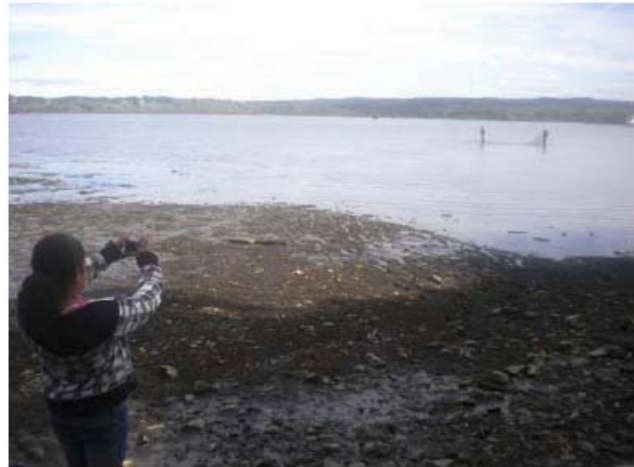
Students from Kingston's George Washington Elementary seine for fish during the blow out low tide at the Esopus Meadows Environmental Center.

Fishermen know that a strong northwest wind over two or three days can result in very low tides, called blowout tides. There was definitely a strong northwest wind on October 8, 2009. Hair