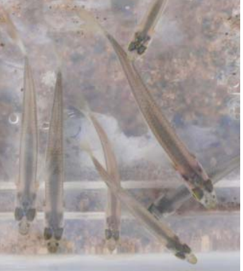
Atlantic silversides, a marker of salty conditions, at Englewood