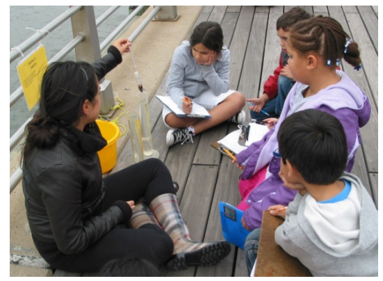
Students measuring salinity at Pier 45, Manhattan

Answers: The main reason the salt front was further south this year was precipitation. Runoff after rain flushes freshwater through the river, pushing salt water down the river towards the ocean. Even though it hadn't rained in the few days before Oct.14, runoff from heavy rains earlier in the month was still making its way into the river from the watershed.