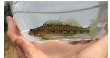
A greenside darter from Schoharie Creek (above) and a northern pipefish seined at Norrie Point (below).