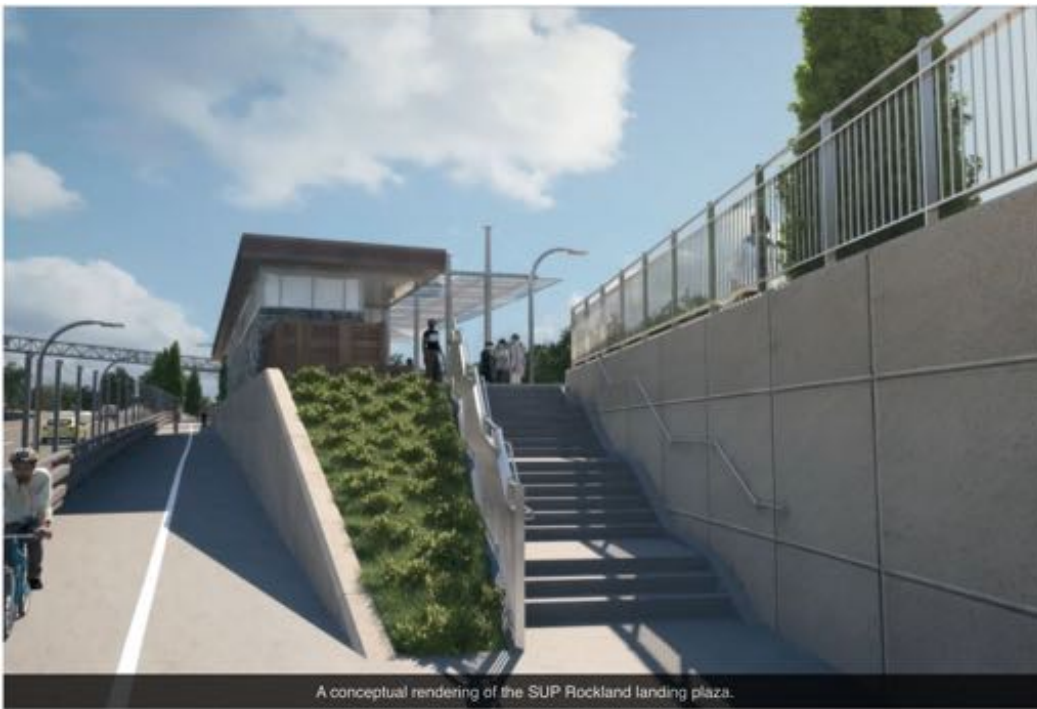
A conceptual rendering of the SUP Rockland landing plaza.

Artist renderings of some of the possible features of the Nyack Landing for the Pedestrian Bike Trail. For more on the pathway: https://www.newnybridge.com/the-path/