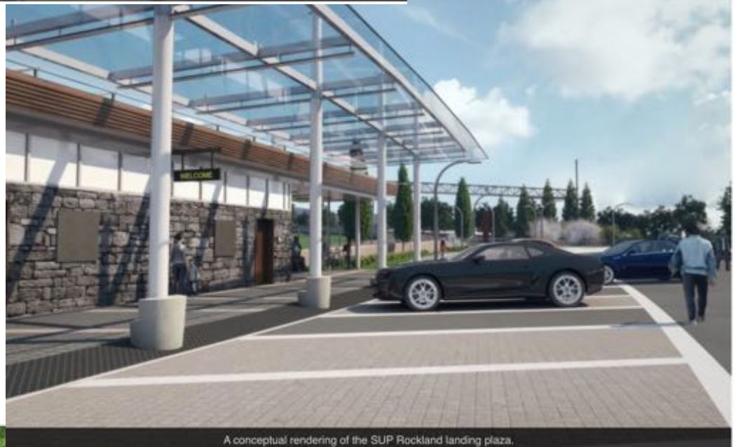
A conceptual rendering of the SUP Rockland landing plaza.

Artist renderings of some of the possible features of the Nyack Landing for the Pedestrian Bike Trail. For more on the pathway: https://www.newnybridge.com/the-path/