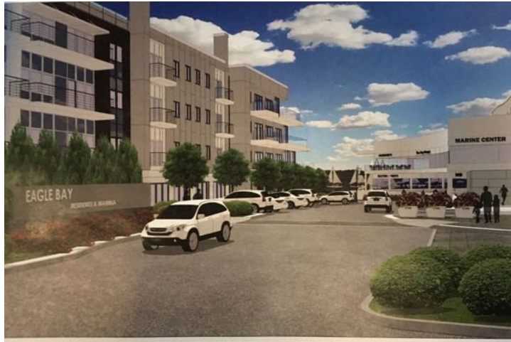
Architectural rendering, 2018. © 2018 The Breakers Stony Point, LP. All rights reserved. No part of this document may be reproduced without written permission from The Breakers Stony Point, LP. EAGLE BAY Stony Point, NY THE BREAKERS STONY POINT, LP. VIEW 6