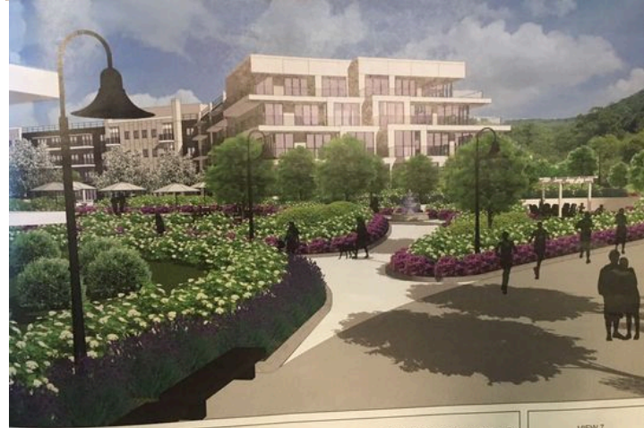
Architectural rendering, 2018. © 2018 The Breakers Stony Point, LP. All rights reserved. No part of this document may be reproduced without written permission from The Breakers Stony Point, LP. EAGLE BAY Stony Point, NY THE BREAKERS STONY POINT, LP. VIEW 7