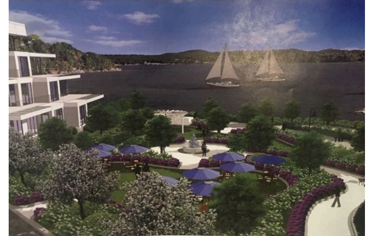
Architectural rendering, 2018. © 2018 The Breakers Stony Point, LP. All rights reserved. No part of this document may be reproduced without written permission from The Breakers Stony Point, LP. EAGLE BAY Stony Point, NY THE BREAKERS STONY POINT, LP. VIEW 8

Series of images from community meetings for the proposed project. Taken by George Potanovic President of the Stony Point Action Committee for the Environment.