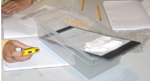
Figure 1) Lab Supplies