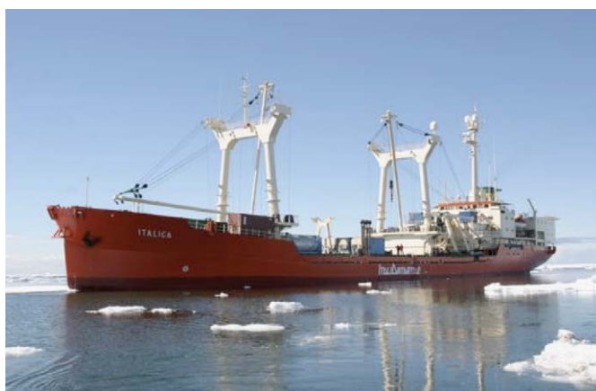
Fig. 3. The Research Supply Vessel Italica used during the CLIMA Program.

(Budillon and Spezie, 2000) and over the continental slope (Bergamasco et al., 2002). CLIMA current meter moorings extend the coverage of the AnSlope program's arrays.