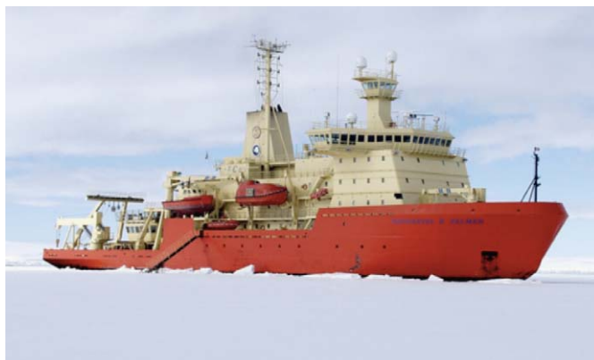
Fig. 2. The Research Vessel Ice Breaker Nathaniel B. Palmer used during AnSlope.

The Italian CLIMA program in the Ross Sea has provided the general framework in which physical oceanographic activities within the Italian National Program for Antarctic Research have been carried out since 1994. The CLIMA program, utilizing the Research Supply Vessel Italica (Fig. 3), has studied various aspects of the Ross Sea continental shelf, with a focus on the Terra Nova Bay region. CLIMA obtained CTD data over the Ross Sea shelf, including along the shelf ice margin and within Terra Nova Bay