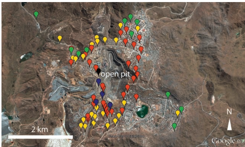
Fig. 2. Aerial image of the main open-pit mine and surrounding town of Cerro de Pasco, Peru, showing locations where the lead concentration in soil a was measured, 2009

The Ayapoto area mentioned in the main text is located immediately to the west of the open pit.