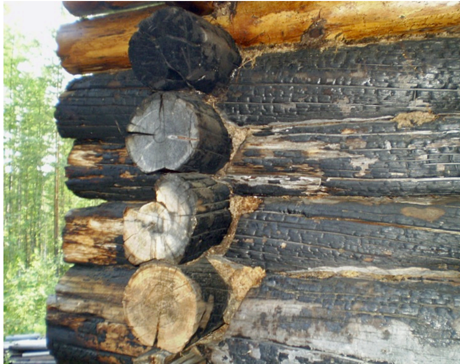
Burned logs from trees scorched in 1908