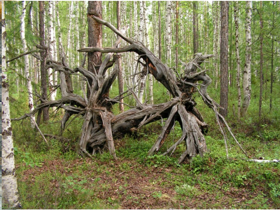
Stumps of fallen trees