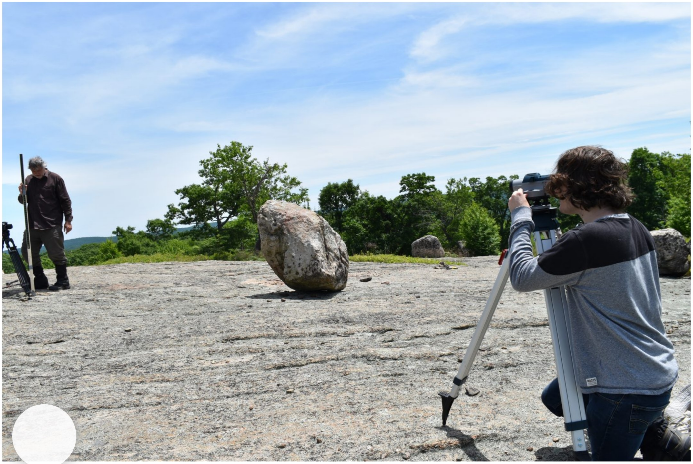
Calibrating the camera to take images at a consistent level above the ground.

Menke was also scouring the area for exposed earthquake faults, but admitted he had not seen anything conclusive. At one juncture, he pointed out a squiggly, 20-foot crack in the bedrock. It looked like minerals had long ago filled in whatever void had once existed. He speculated it could be a minor fault that had formed underground millions of years ago. Or, maybe it was just a plain old crack.